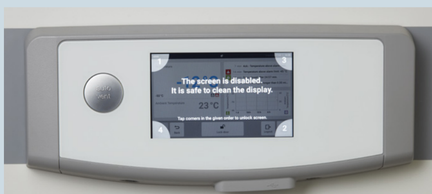
Touch screens can be cleaned by locking the screen: tap Menu > Clean Screen — the touch screen is now locked and ready for cleaning