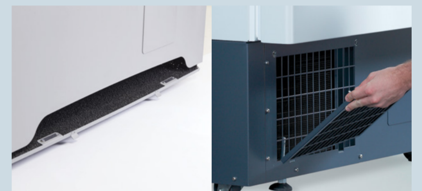
Remove filter from behind the filter grill