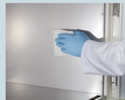
Wipe the inner chamber using a soft, lint-free cloth