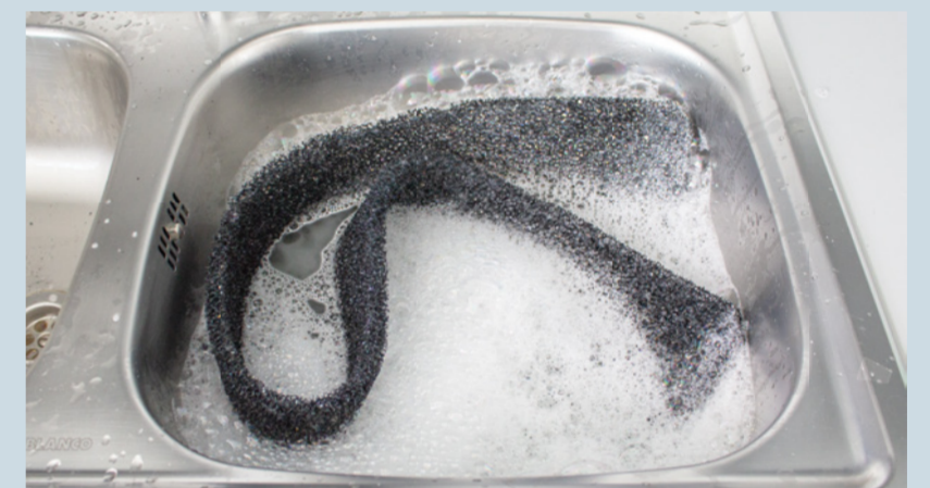
Wash the filter with a mild detergent