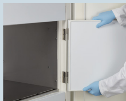
Remove inner doors for convenient cleaning