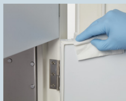
Wipe the inner doors and their seals