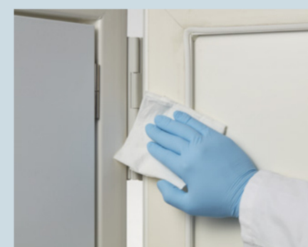
Wipe the outer door and its seal